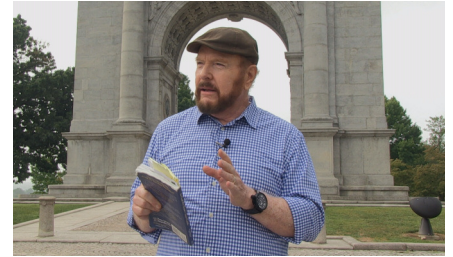
Speaking at Valley Forge Memorial on the Grand Tour

WORLD HISTORY INSTITUTE • PO BOX 4673 • THOUSAND OAKS, CA 91359